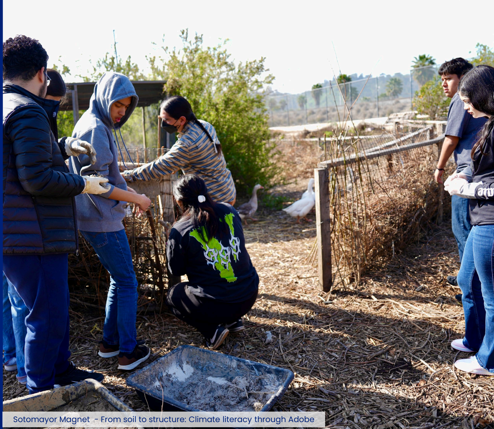
Sotomayor Magnet - From soil to structure: Climate literacy through Adobe