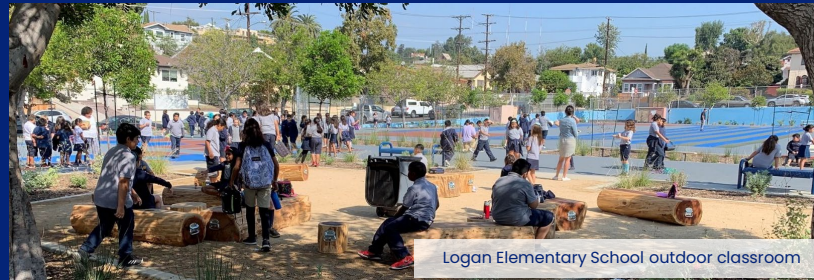
Logan Elementary School outdoor classroom