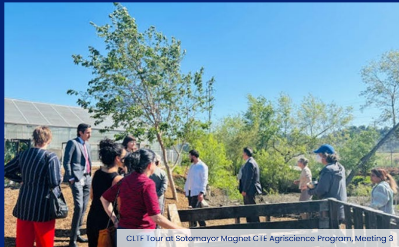
CLTF Tour at Sotomayor Magnet CTE Agriscience Program, Meeting 3