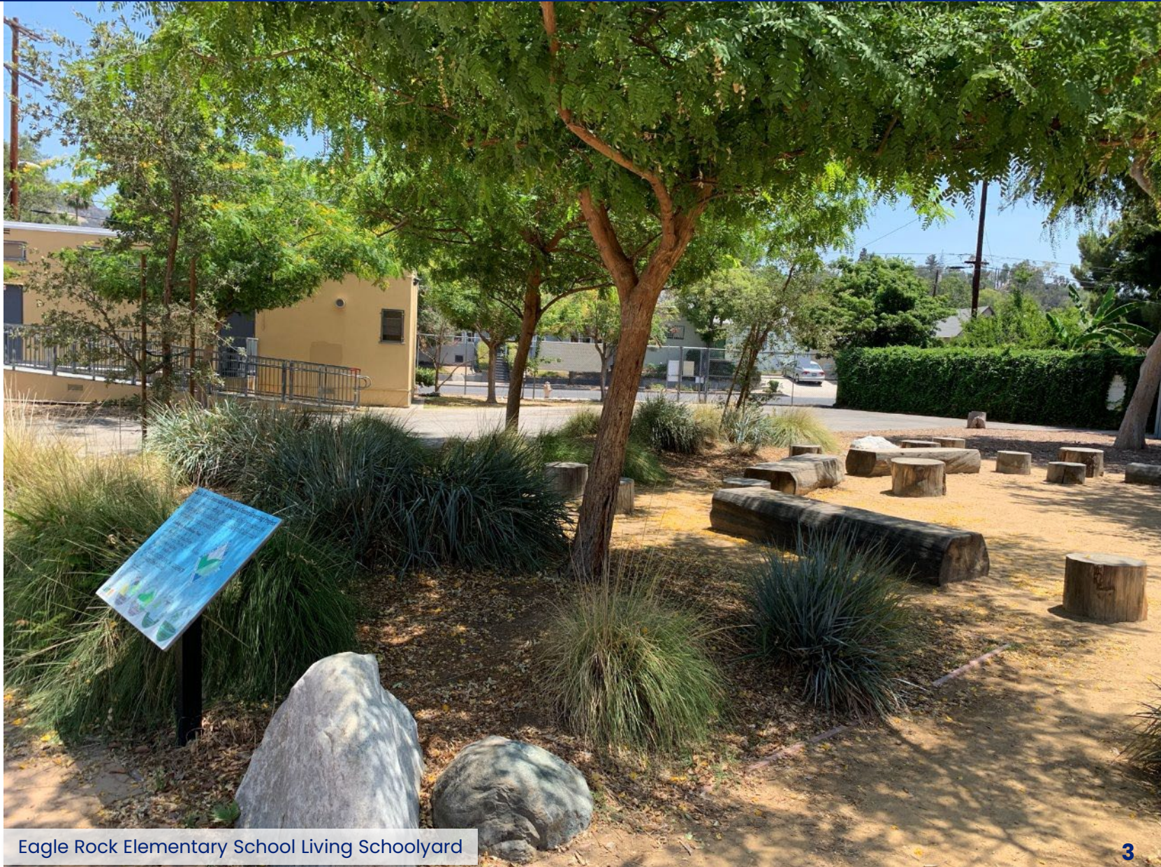
Eagle Rock Elementary School Living Schoolyard