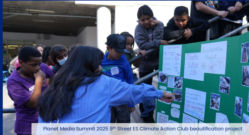
Planet Media Summit 2025 9th Street ES Climate Action Club beautification project