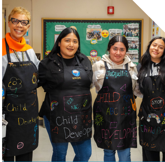
Early Education Career Training