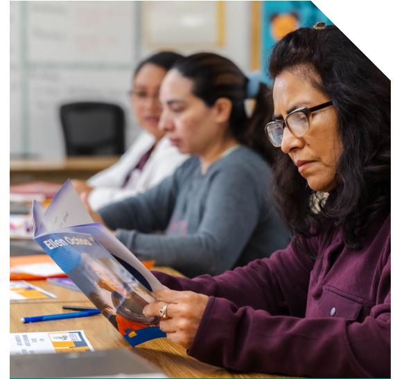
Family Literacy Program