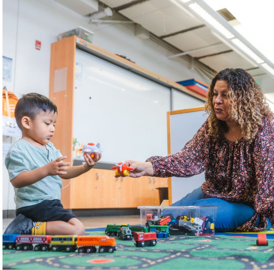
Early Education Collaboration