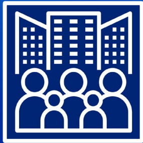
Civic and Business Leaders

Additional Groups/Individuals engaged include: