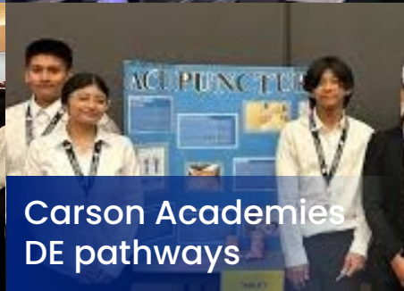
Carson Academies DE pathways