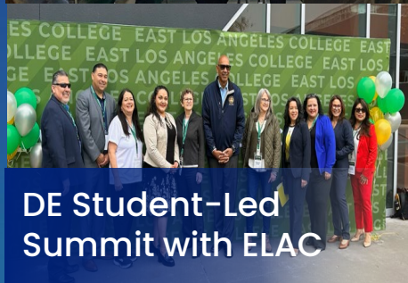
DE Student-Led Summit with ELAC