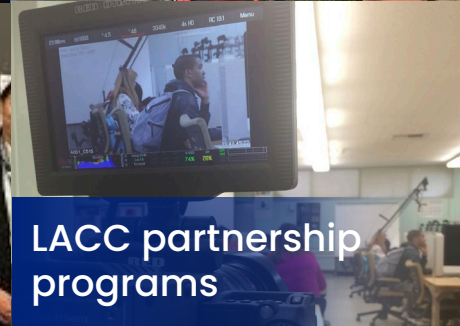
LACC partnership programs