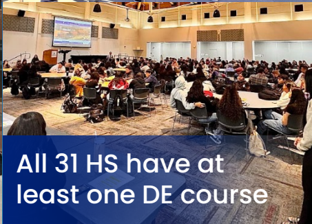
All 31 HS have at least one DE course