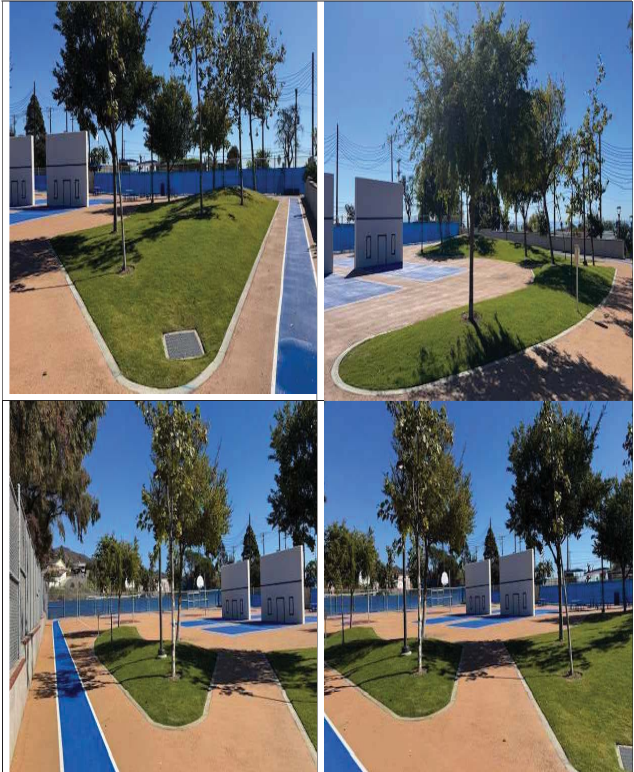
New pavement and landscaping