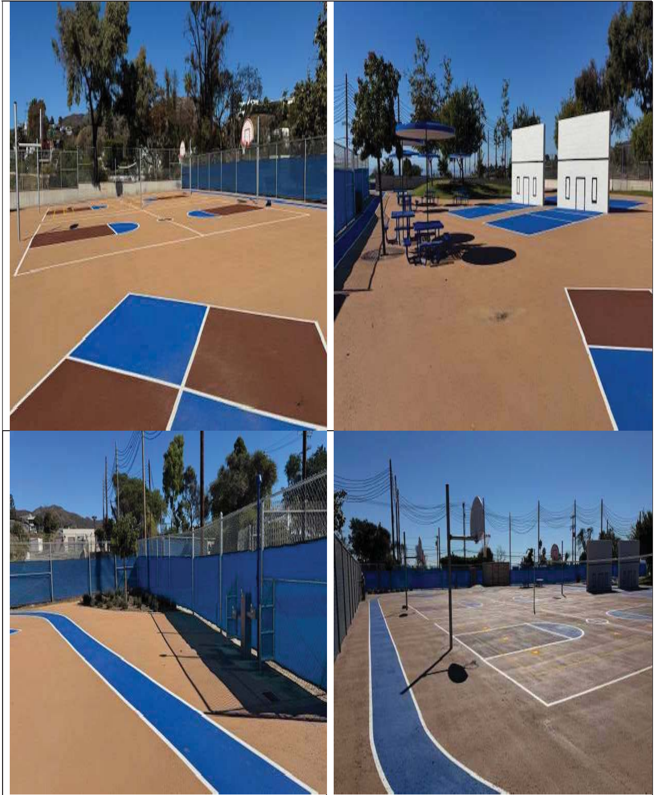
Improvements to the play yard