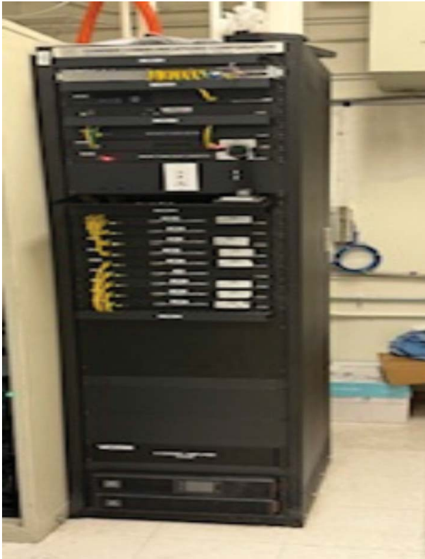
Cohasset ES – PA System