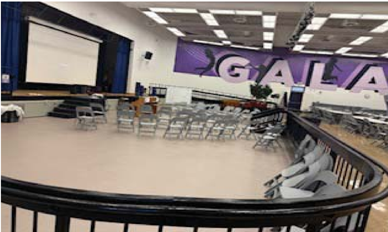
GALA - Auditorium