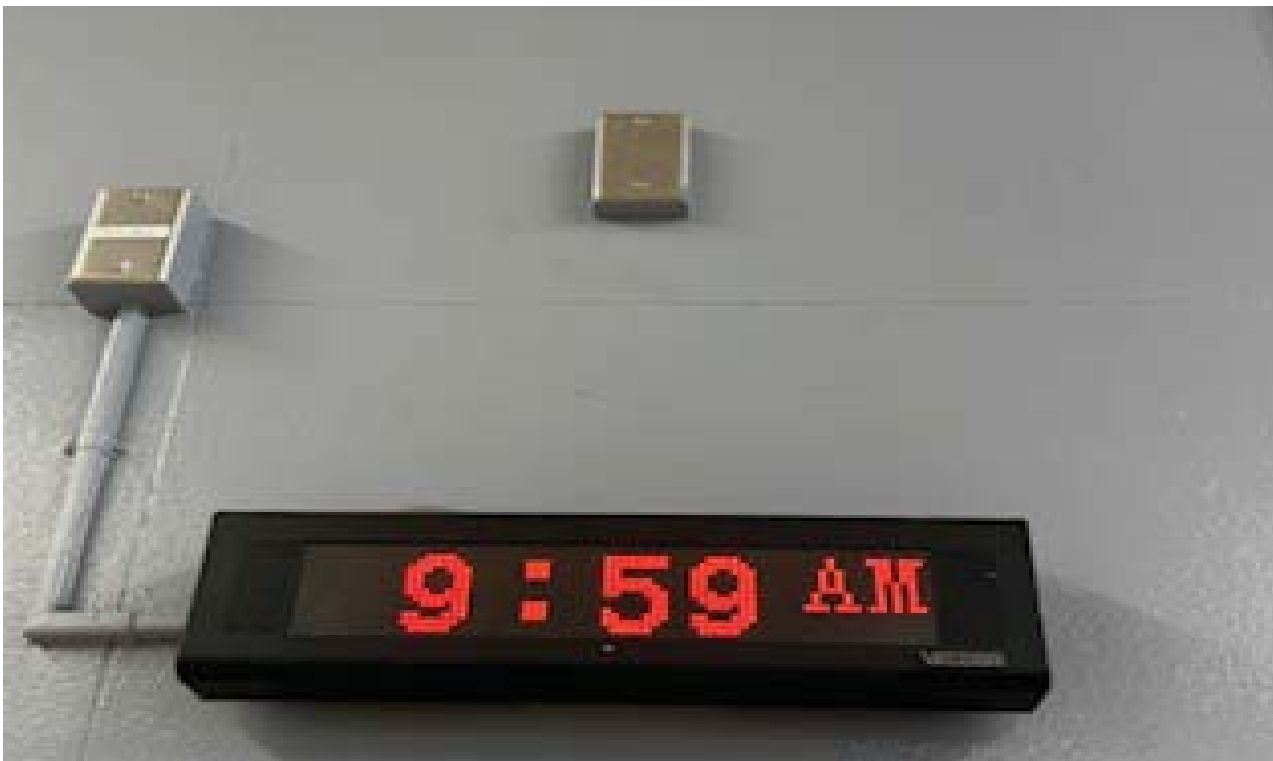
Cohasset ES – PA Marquee Sign