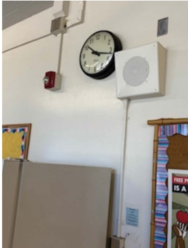
Cohasset ES – Indoor Speaker