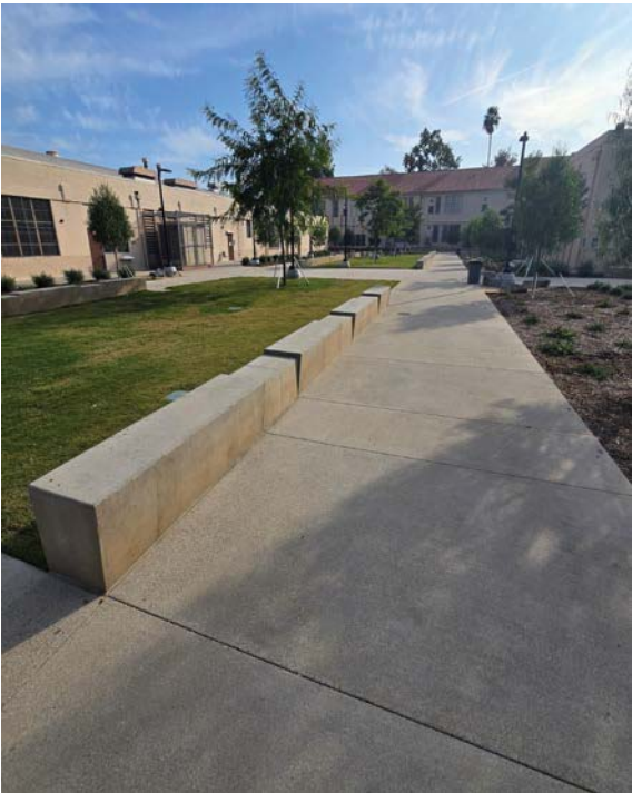
New concrete benches