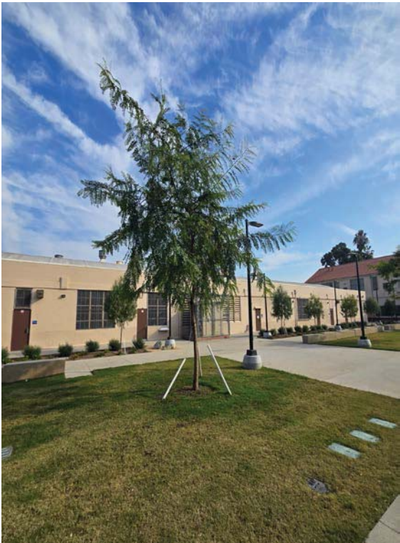
Newly planted trees and grass