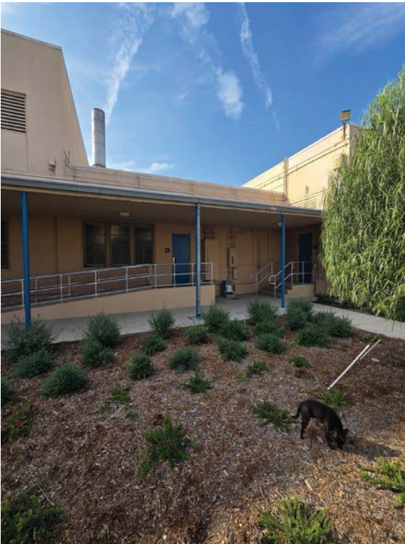
Newly planted shrubs and mulch