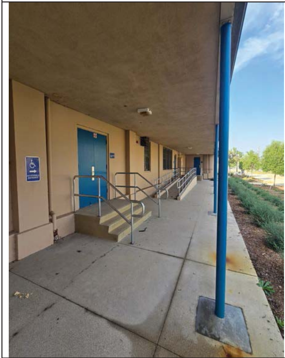
New concrete steps and ramps