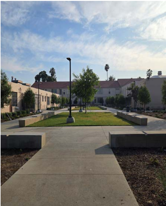
New concrete Quad floor