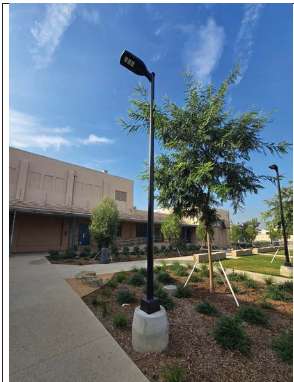
Light poles and concrete bases