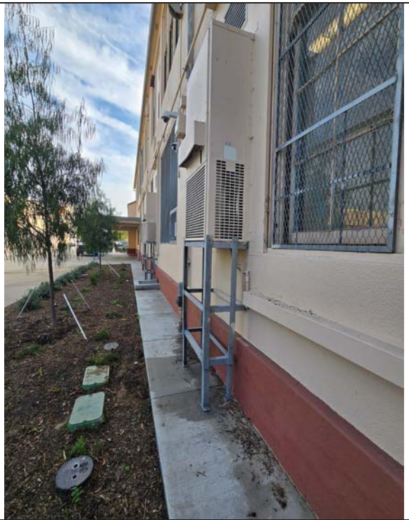
New metal HVAC supports