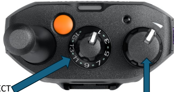
CHANNEL SELECT KNOB