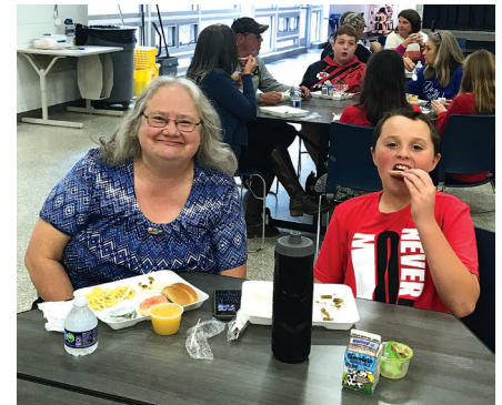
Warren Middle School students enjoyed sharing a meal with their grandparents in December.