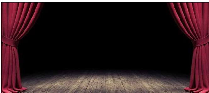
Informal Resolution: Live Example