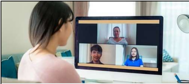
Informal Resolution: Scenario Review