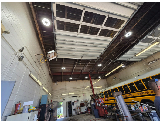
Bus garage LED lighting