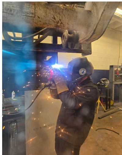
B.6 Locker room roll door