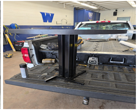
Rebuilt office table