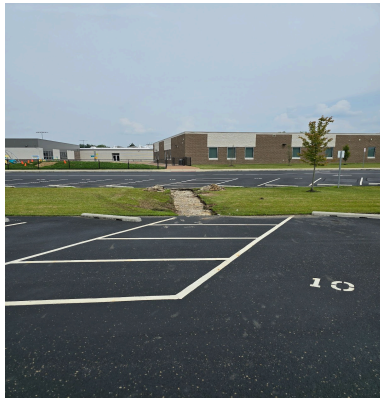
WES Sidewalk renovation