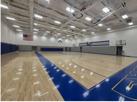
WMS gym painting