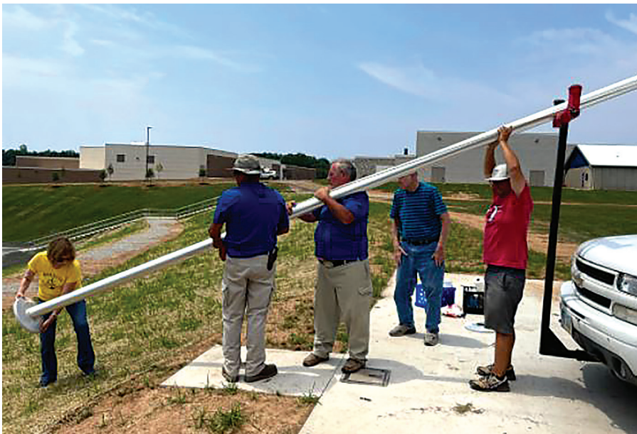
Raising of the new flagpoles at Warrior stadium.