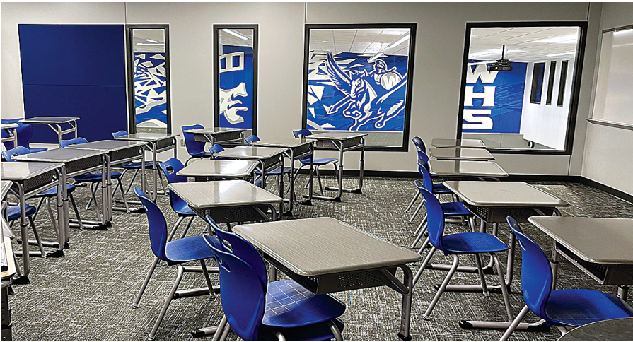
High school classrooms are ready for students.