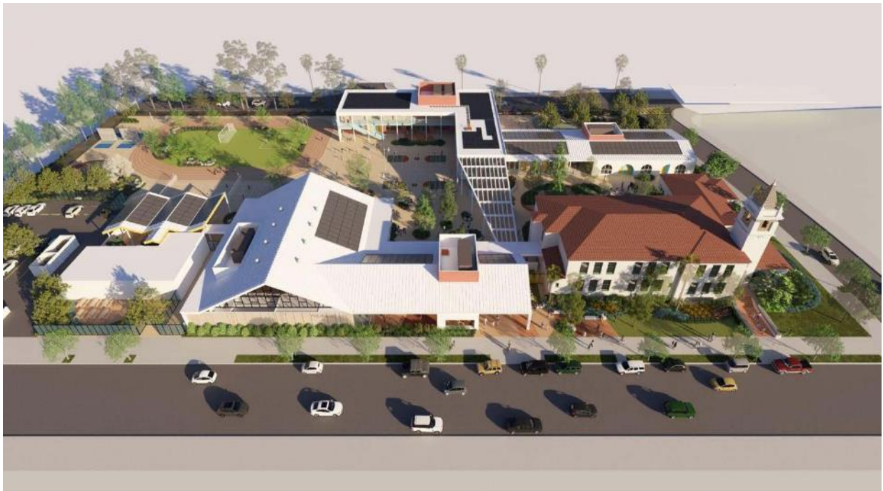
Overall Campus Aerial View