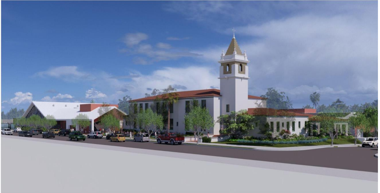
View along Via De La Paz