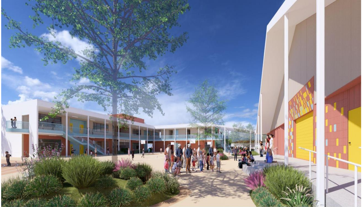
View of Playground with Outdoor Stage at right and Classroom Building beyond