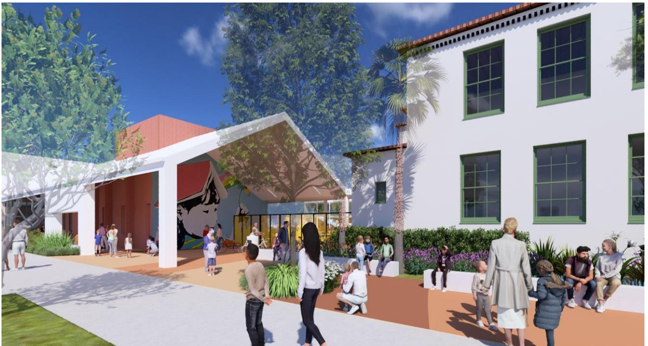
Main Campus Entry