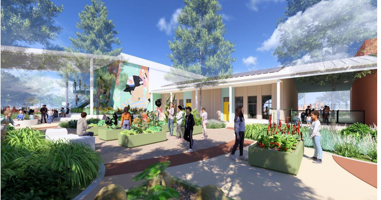
View of Outdoor Learning Environment