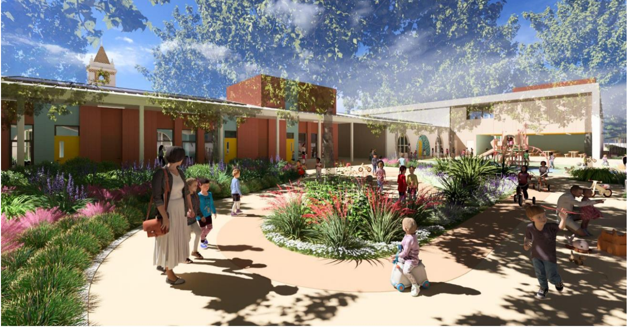
View of the Kindergarten Play Area