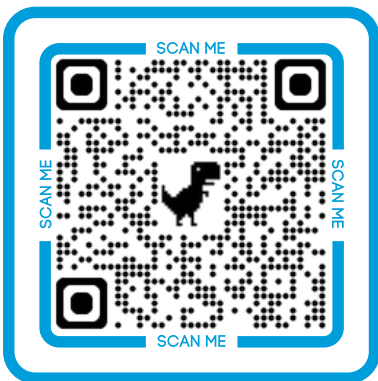
X (FORMERLY TWITTER)