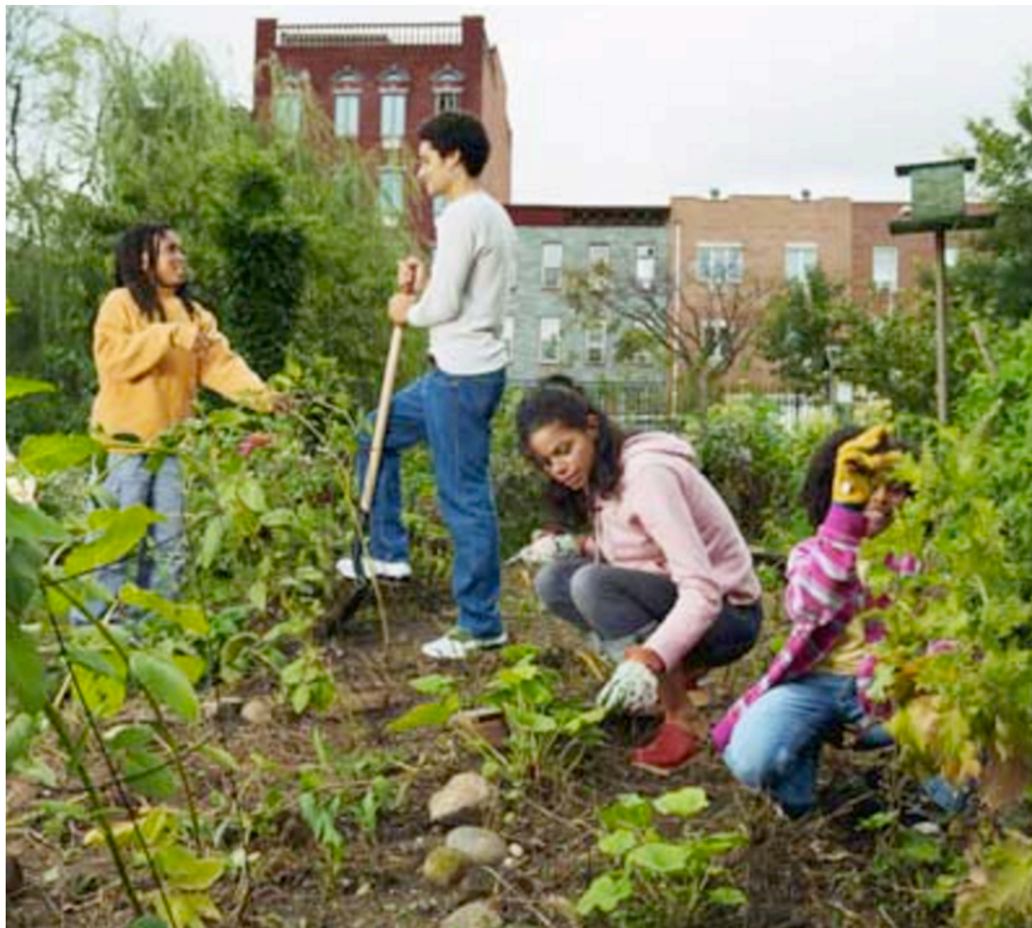
Teacher Visual Text for Conversation Pattern