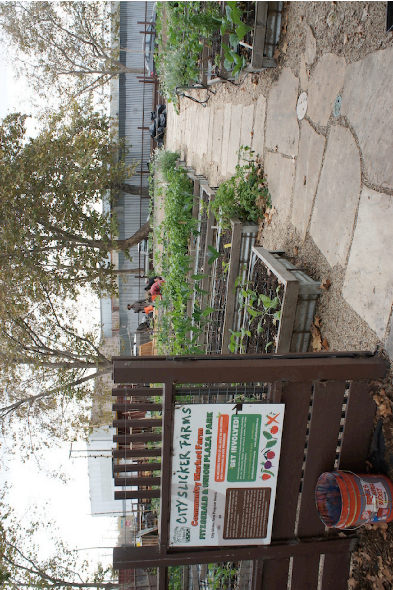
Teacher Visual Text