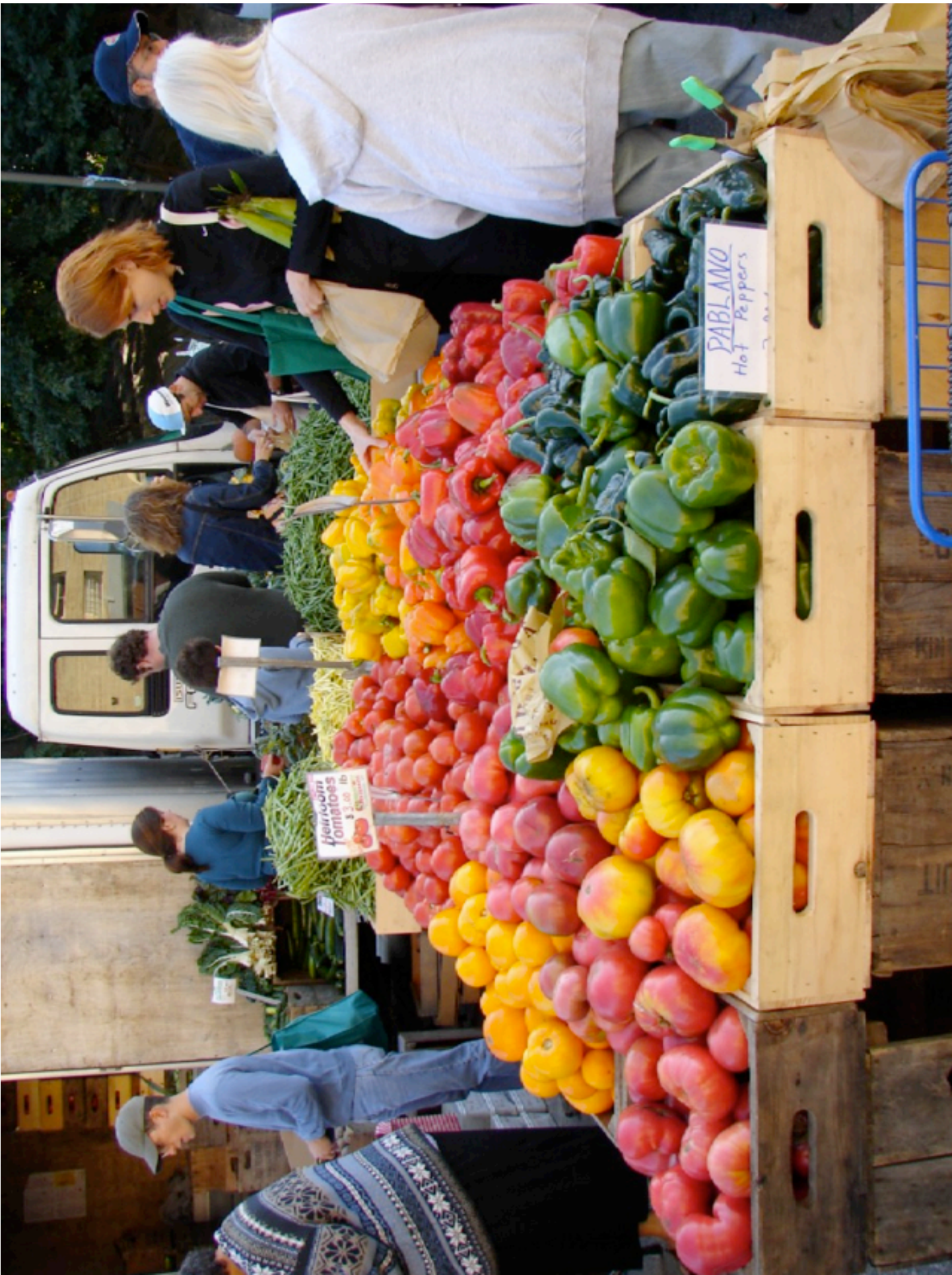
Student Visual Text